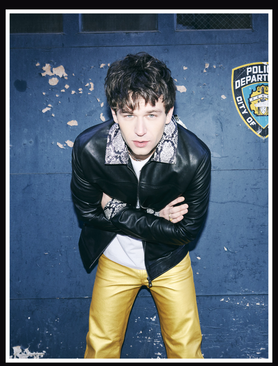
TOTAL LOOK: KIELLE PARIS BOOTS: DR. MARTEN'S