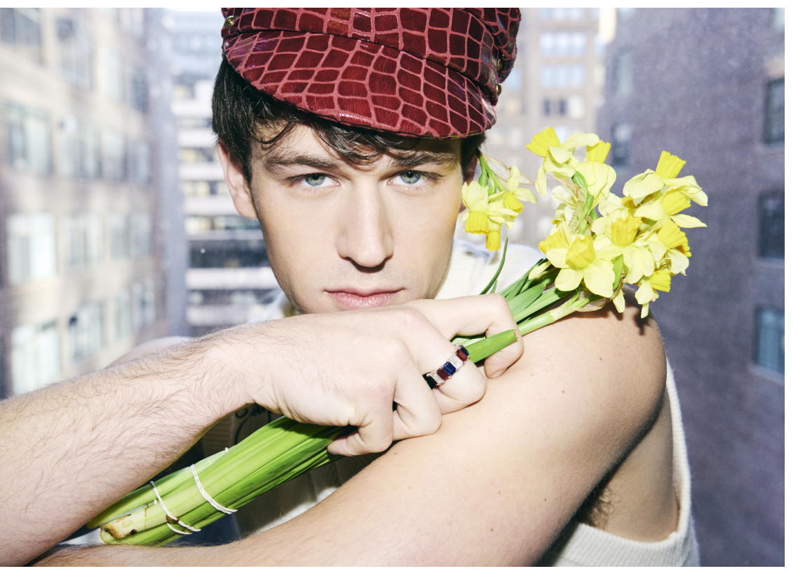
VEST: SONS OF GEMINI CAP: FRESHY

"Like it or not, because of '13 Reasons Why', I'm known as a high school student, but I'm 31 now, so it was time to move on from that and see how I could 'grow up' in my career."